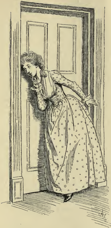
Listening at the door.